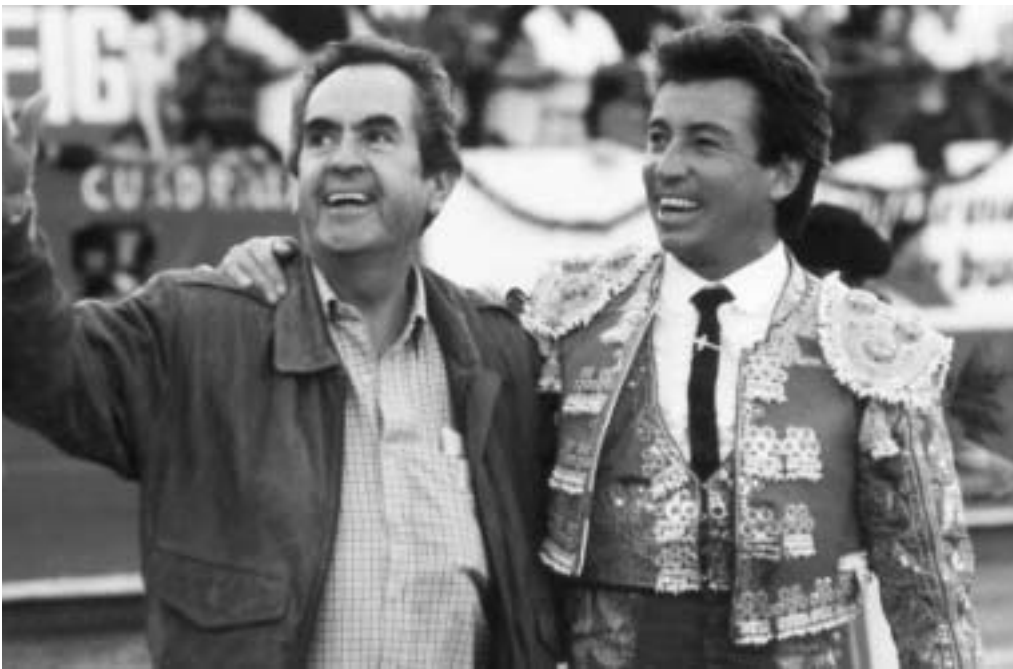
After an outstanding performance by his bulls, Baillères is joined by matador Miguel Espinoza, 'Armillita,' in the Plaza Mexico, 1994.