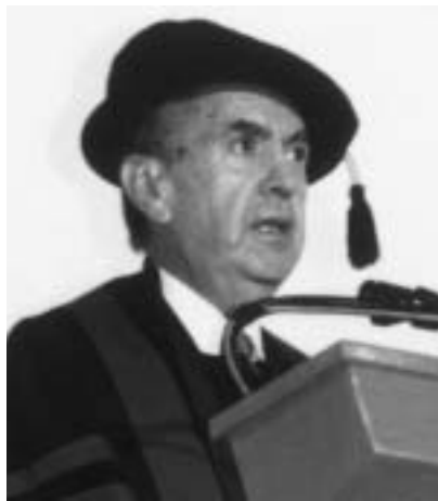
Baillères speaks at an ITAM gathering.

"I wanted it to be a whole experience, a way of life. Either you are or not totalmente palacio