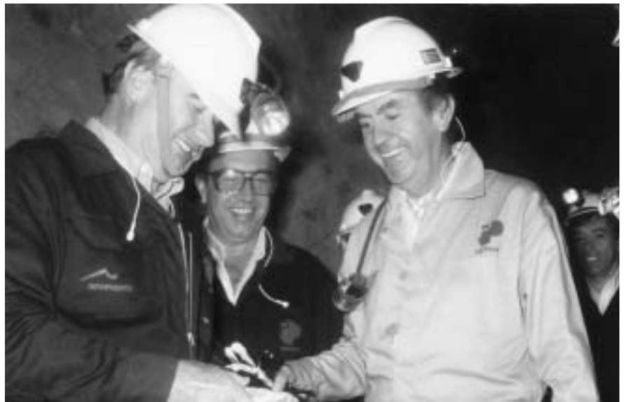
Baillères inspects one of the silver mines of the Penoles Mining Group, 1998.

"One has to be romantic about his work. Being an entrepreneur is an art more than a science, an art that few people fully understand," he said.